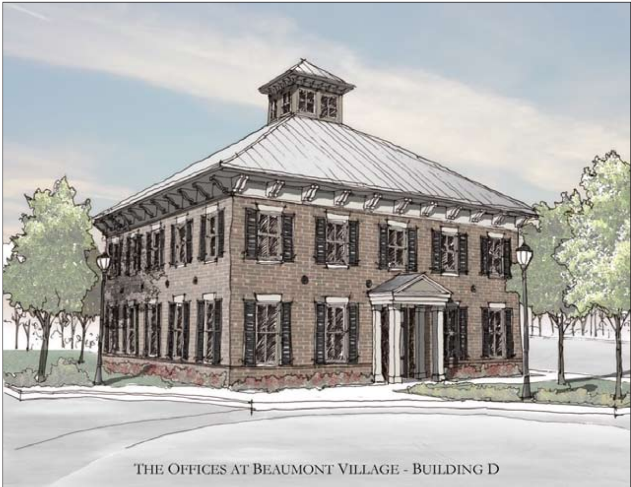
THE OFFICES AT BEAUMONT VILLAGE - BUILDING D